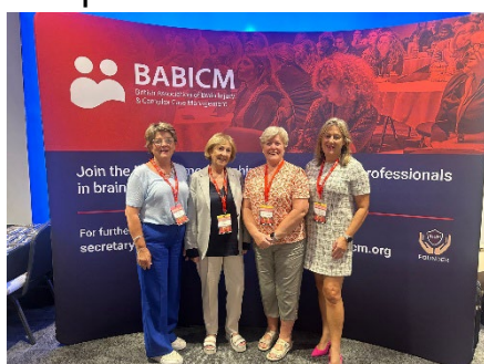
The MCS Team

The conference theme, The Power of Possibility, resonated deeply with our team. It reminded us of the importance of staying open to new approaches, embracing challenges, and continually advancing our knowledge to better support those with complex needs.