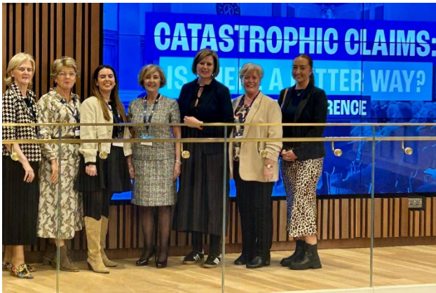
The MCS Team